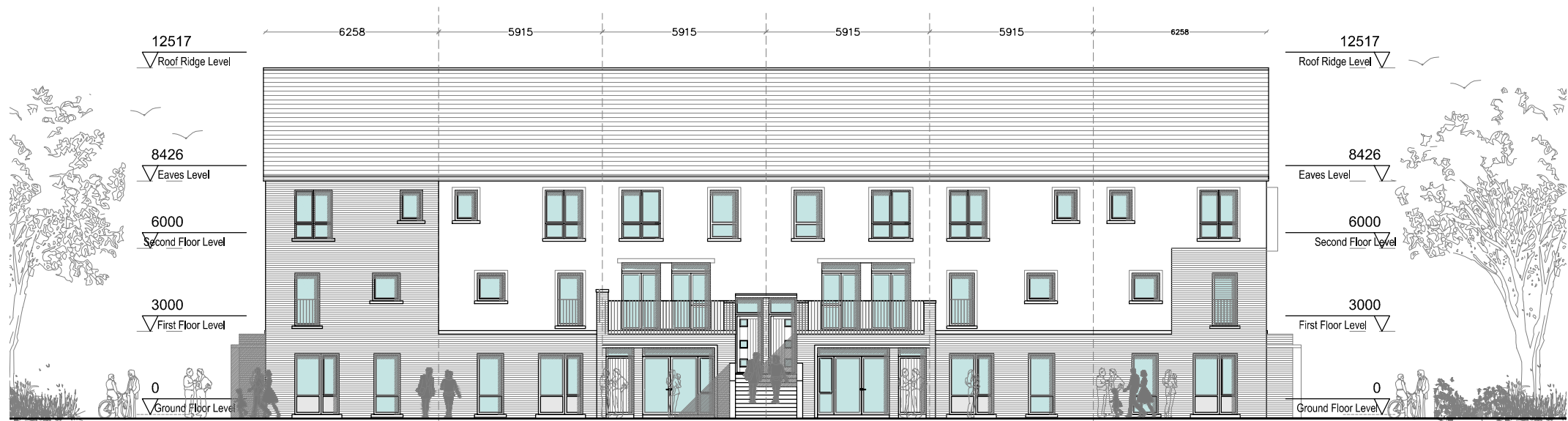
Eastern Elevation SCALE 1:200 @ A3